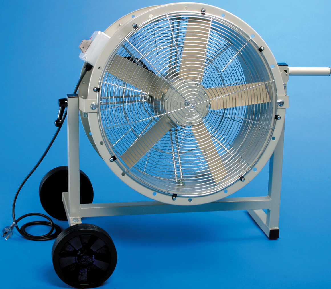
Model CCE564 shown