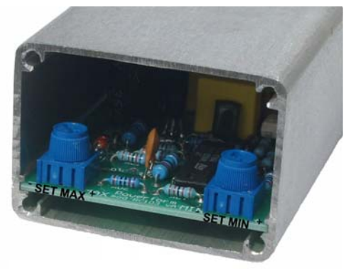
Easy Custom Calibration